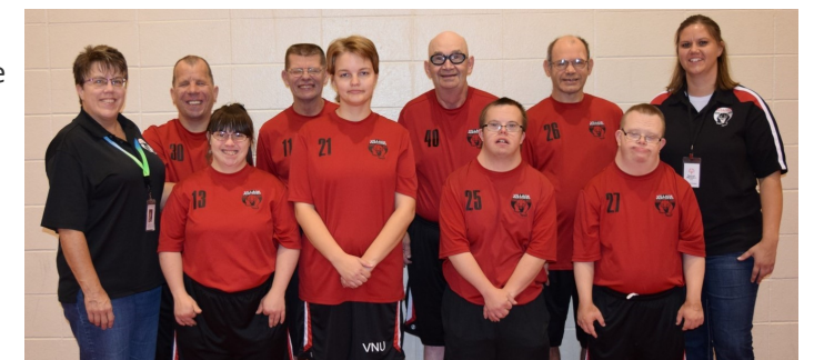
Division 4B Team - Third Place