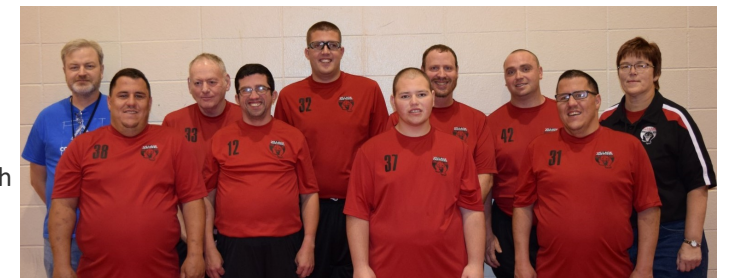
Division 2 Team - First Place